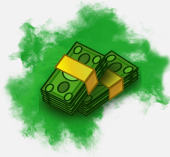
VENTURE & MONEY INVESTMENT