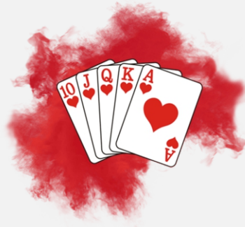
GAMBLING, BETTING & CASINOS