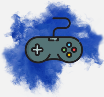
VIDEO GAMES & GAME DEVELOPMENT

Data40 was founded in 2019 by a team of highly involved specialists from multiple industries. With more than 15 years of experience at the peak of technologies and methodologies in research, analytics and marketing we are committed to share our knowledge within the industries that we love and know best.